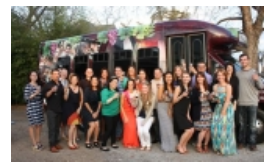
Grapevine Wine Tours Guests Vote Homestead Tops