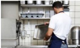
Every Restaurant's Unsung Hero