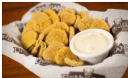
Bennigan's Says It's 'Halfway to St. Paddy's...Party Time!'