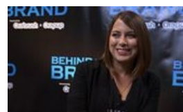
Taco Bell's Social Sauce: Less Sales, Mas Fun