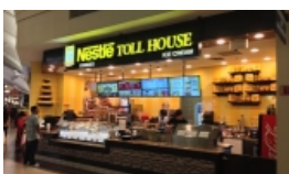
Nestlé Toll House Café by Chip Pairs Suburban Shopping With Sweet Treats and Smiles at