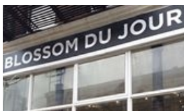
Vegan Restaurant Chain Expands