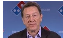
Domino's Pizza Can Use 20,000 More Employees: CEO Doyle