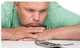
Restaurateurs Split on Phones at the Table