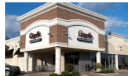
Why Chipotle Won't Franchise