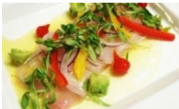
The Joint at Cape Harbour to become Fathoms Restaurant & Bar