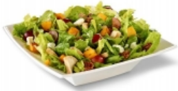
Saladworks Embraces Fall With New Farm Fresh Salad